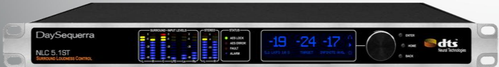
DaySequerra NLC 5.1ST Surround Loudness Control