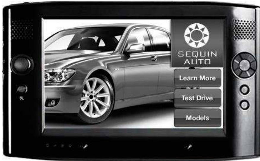
Figure 4.2 – Application Framework along with basic ATSC-M/H audio+video service.

The Application Framework adds additional signaling and data content to the basic ATSC-M/H audio-visual service. Figure 4.2 illustrates the results of an Application Framework when provided along with basic ATSC-M/H service.